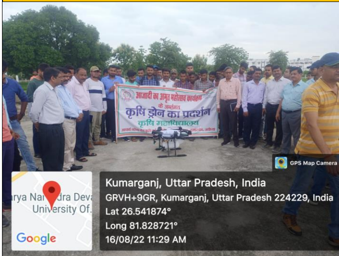
Demonstration of Drone Technology on Instructional Farm on 16 August, 2022