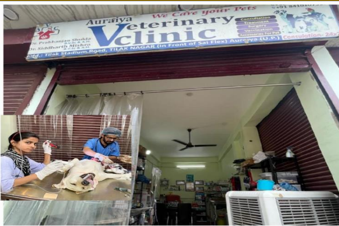
A student in his Pet Clinic