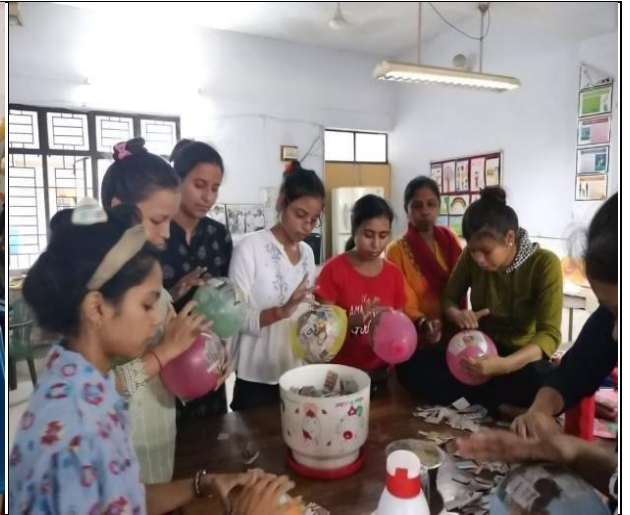
Students Preparing Teaching Aids for Early Childhood Education on 27-09-2022.