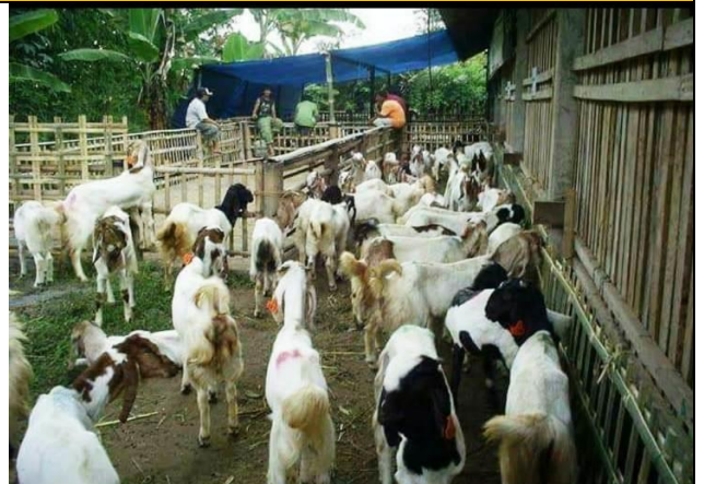
A student in his Goat Farm