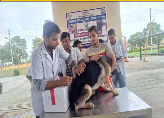
Rabies Vaccination drive on the occasion of World Rabies Day. (28 September, 2022)