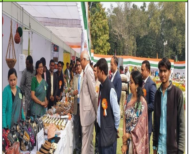
Students' Training on Preparation of Processed Horticultural Product for Exhibition-cum-Sale on 30 th September, 2022