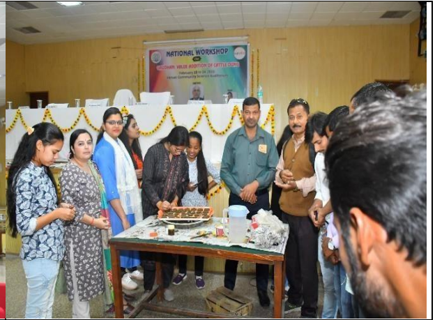
Two days National workshop on Gaudhan: Value Addition of Cattle Dung organized by Community Science from 23-24 February, 2023