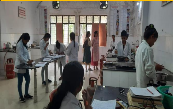
Hands on training of the students on therapeutic diet on 4 th September, 2021