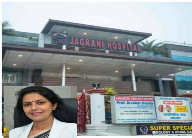
A student Dietician in her hospital