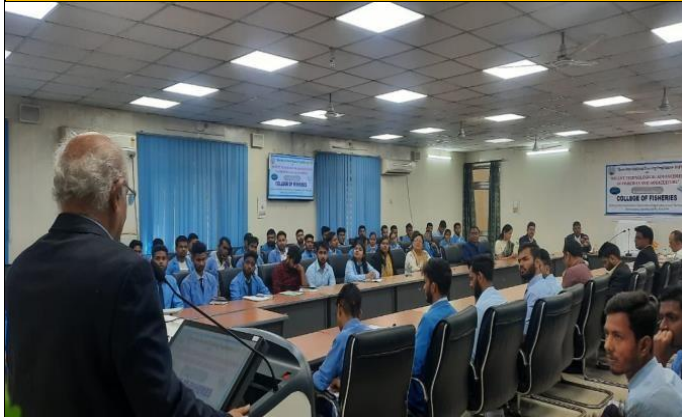
Training Programme for skill development of students on “Recent Technological Advancements in Fisheries and Aquaculture.” from 2-4 March, 2023