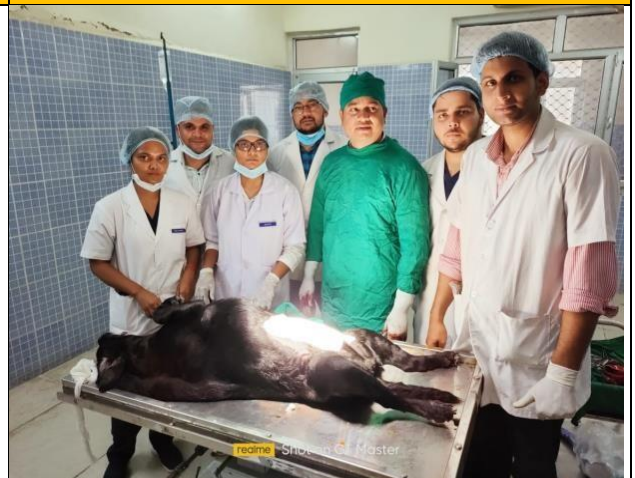
Students learning Surgical Skills at Veterinary Clinical Lab on 22 nd March, 2022