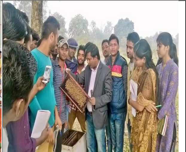
Training for Entrepreneurial opportunity on Bee Keeping 23 November, 2021