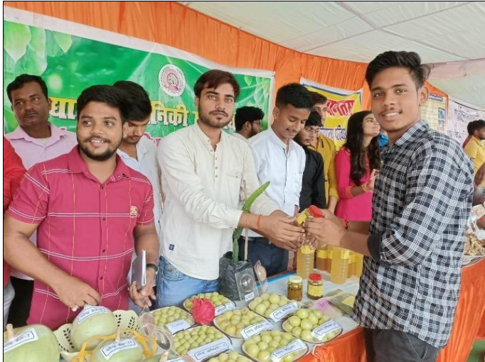
Horticulture and forestry students selling their products in Kisan Mela on 10 October, 2022