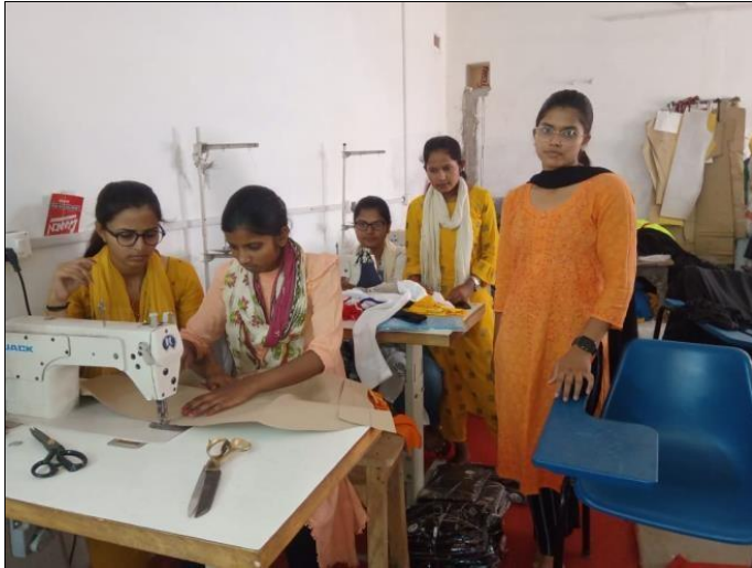
Students learning the use of high-speed machines at hosiery unit during In-Plant training, March 2022 to June 2022.