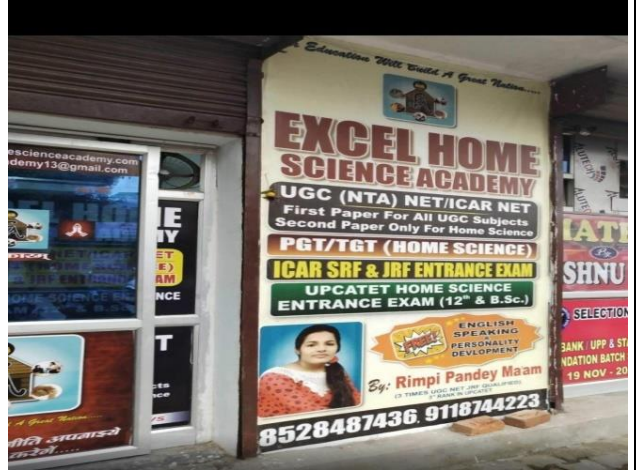
A Coaching started by the student