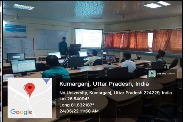
Hands-on- training to the students on use of various Statistical Software for data analysis on 24 May, 2022