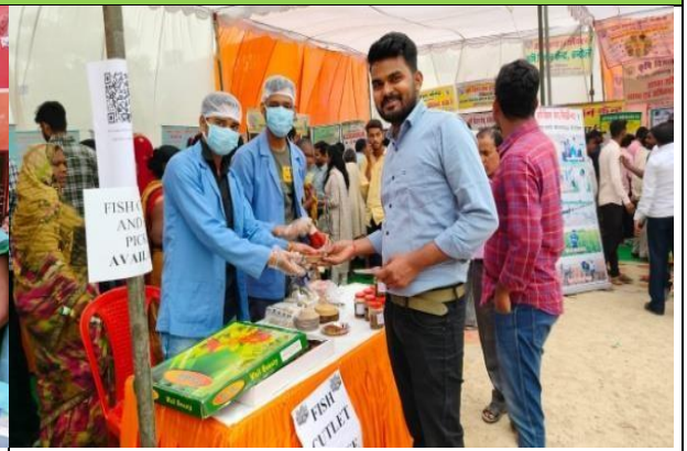
Community Science students selling their products in Kisan Mela from 17-18 March, 2023.