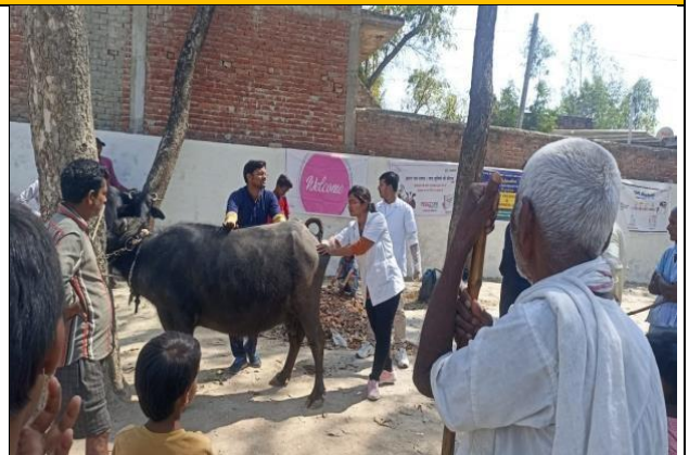
Clinical camp at Jarai kala to provide field exposure to students on 24 July, 2022