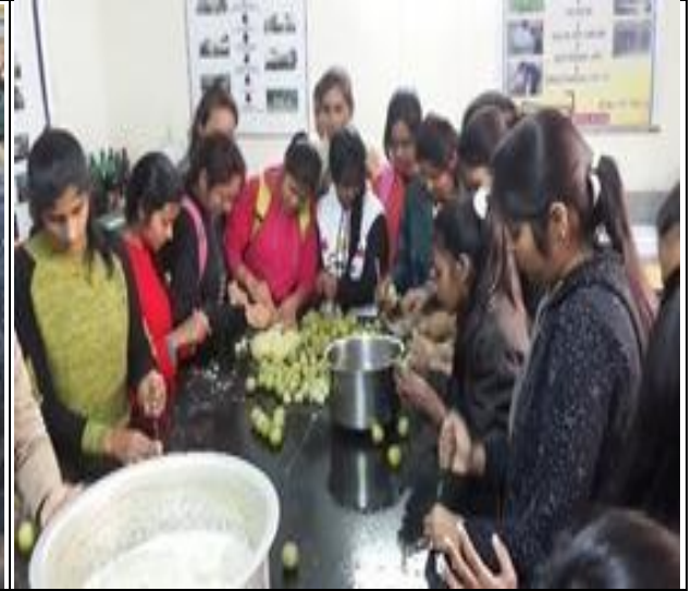
Hands on training of the students during Capacity Building Training on “Processing of Aonla Fruits for Value Addition” (28 th -30 th January, 2020)